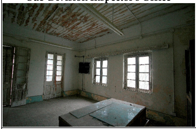
Sub Division Inspector's Office