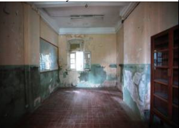
The Armoury and Interview Room