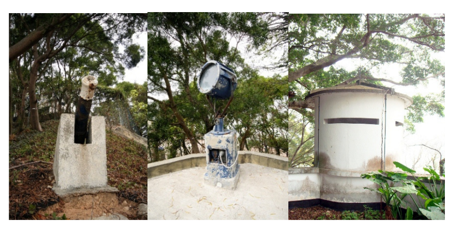
Cannon Searchlight Guard Tower