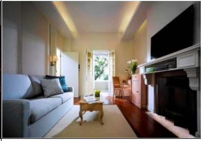
One of the 4 Suites - The Commissioner