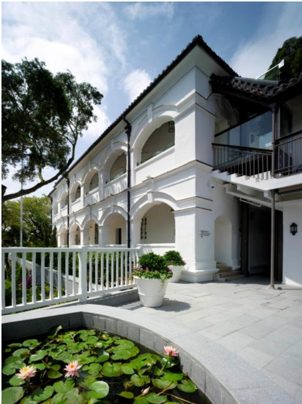
Tai O Heritage Hotel with colonial-style architecture